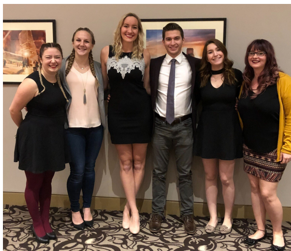
Enjoyed the regional conference formal dinner with the Grant MacEwan and Red River Official and Associate Delegates